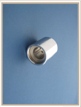
Valve Body \phi 36.3