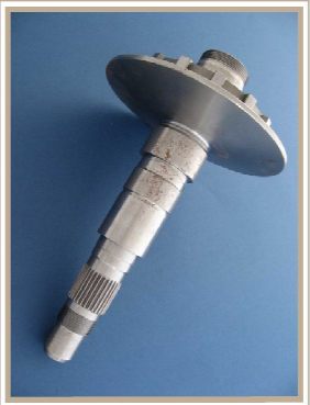
CVT Shaft \phi 31.4