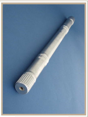
Drive Shaft \phi 31.4