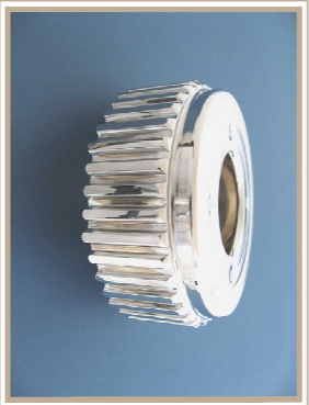
A/T Drum \phi 150.0