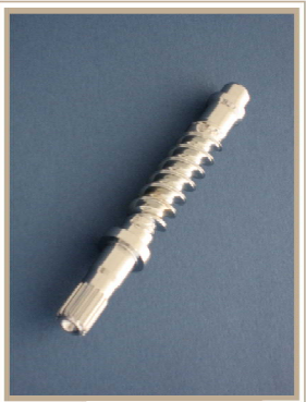
Worm \phi 6.3