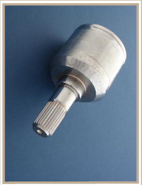
CVT Shaft \phi 26.0