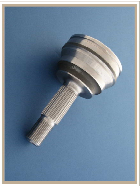
CVT Shaft \phi 25.1