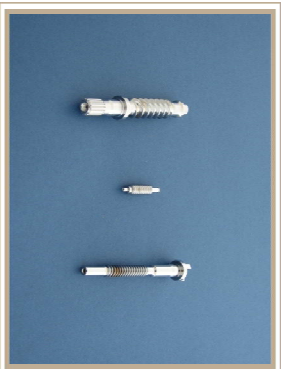
Worm \phi 11.8