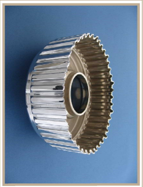
A/T Drum \phi 150.0