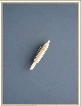
Worm \phi 6.8