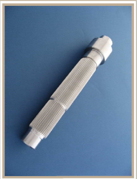
A/T Shaft \phi 39.1