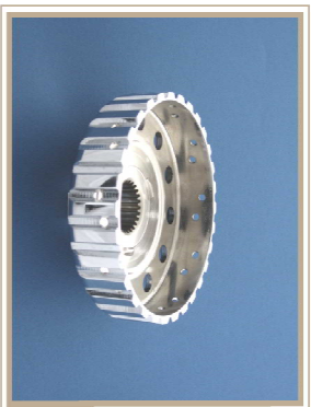
A/T Planetary \phi 115.5