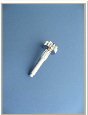
Starter Shaft \phi 15.6