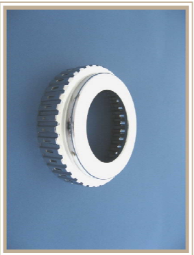
A/T Drum \phi 135.4

Product Examples (Processed Diameter:mm)