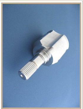
CVJ Shaft \phi 25.8