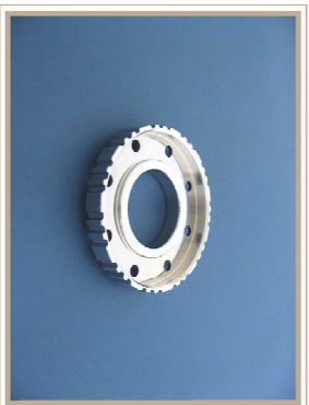
A/T Hub \phi 113.7