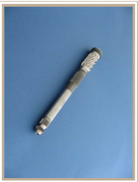
Starter Spindle \phi 21.0