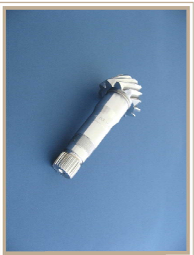
M/T Shaft \phi 25.0