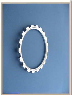
Parking Gear \phi 146.7