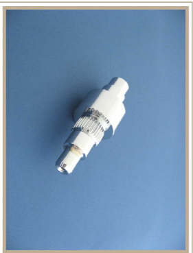
CVT Shaft \phi 33.1