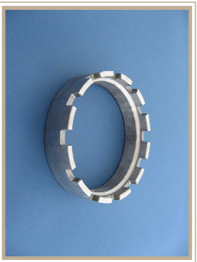
Drive Ring \phi 137.0