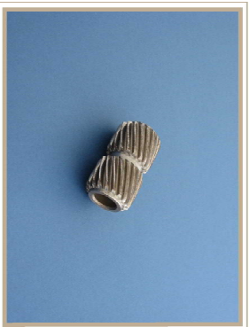
Pinion Gear \phi 30.4