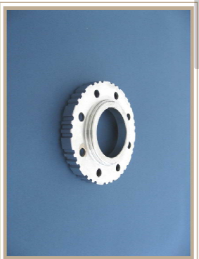
A/T Hub \phi 113.7