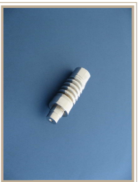
Worm \phi 30.5