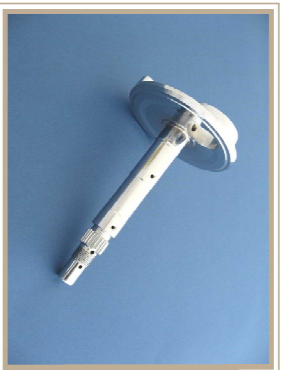
Crank Shaft \phi 17.0